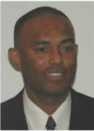
Mariano Rivera of the New York Yankees