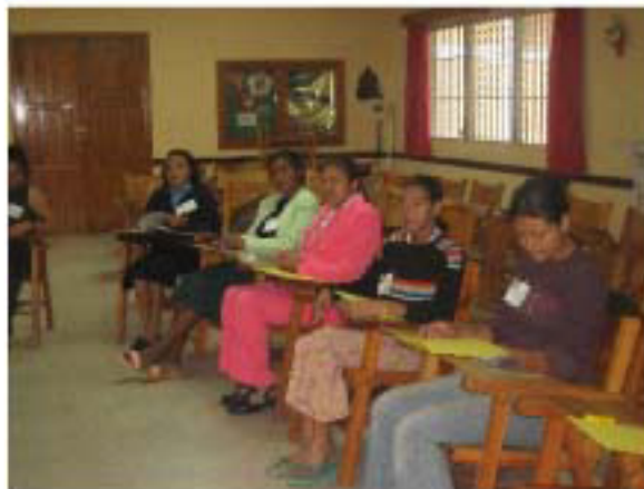
Participants of the Community Health Education Class in El Salvador in March 2007.

In 2007 HHH offered community health and nursing education to over 40 men and women from El Salvador and Panama as well as the provision of medicines, supplies and free dental services to the needy of the Dominican Republic and Haiti, Uruguay, Panama, El Salvador, Nicaragua and Honduras. Dental mission trips are