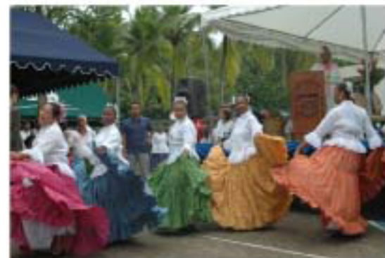
Female Prisoners welcomed HHH in Panama.

In 2006 HHH began a specialty service - caring for prisoners throughout Latin American countries. This effort began in November of 2006 in the Dominican Republic and was extended again in the Dominican Republic (Jan 07) and in Panama (Aug 08). Requests for similar assistance have been received from El Salvador and Guatemala, as well as Honduras. In Panama, female prisoners prepared a special celebration, including folk dances, to thank HHH for their support and assistance.