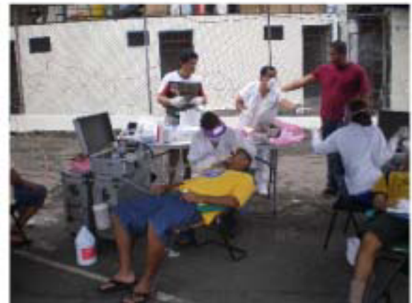
An HHH volunteer treats a patient in Panama.

particularly in demand, and most of the services provided are in extremely rural areas. As a result HHH volunteer dentists must be very flexible and creative, often working in areas with no running water or electricity.